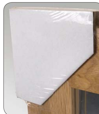
Each mirror is first individually packed with heavy duty corner protection and shrinkwrapped, then further packed into individual cartons.