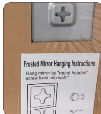
...for portrait or landscape hanging where applicable. All mirrors come with hanging instructions for safe hanging.