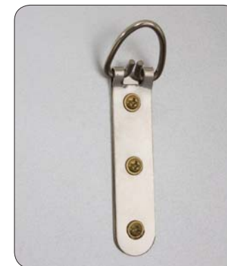
All mirrors have pre-fitted heavy duty hangers...