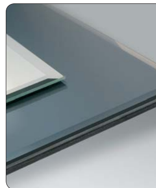
Innova use quality mirror glass 3 to 5mm thick. All exposed glass edges are polished.