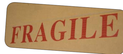
Each carton is marked "fragile".